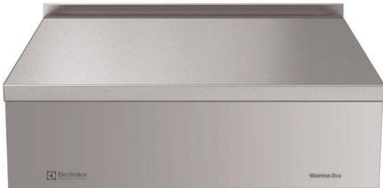
588568 (MBNABBIOO) Closed Work Top, one-side operated with backsplash